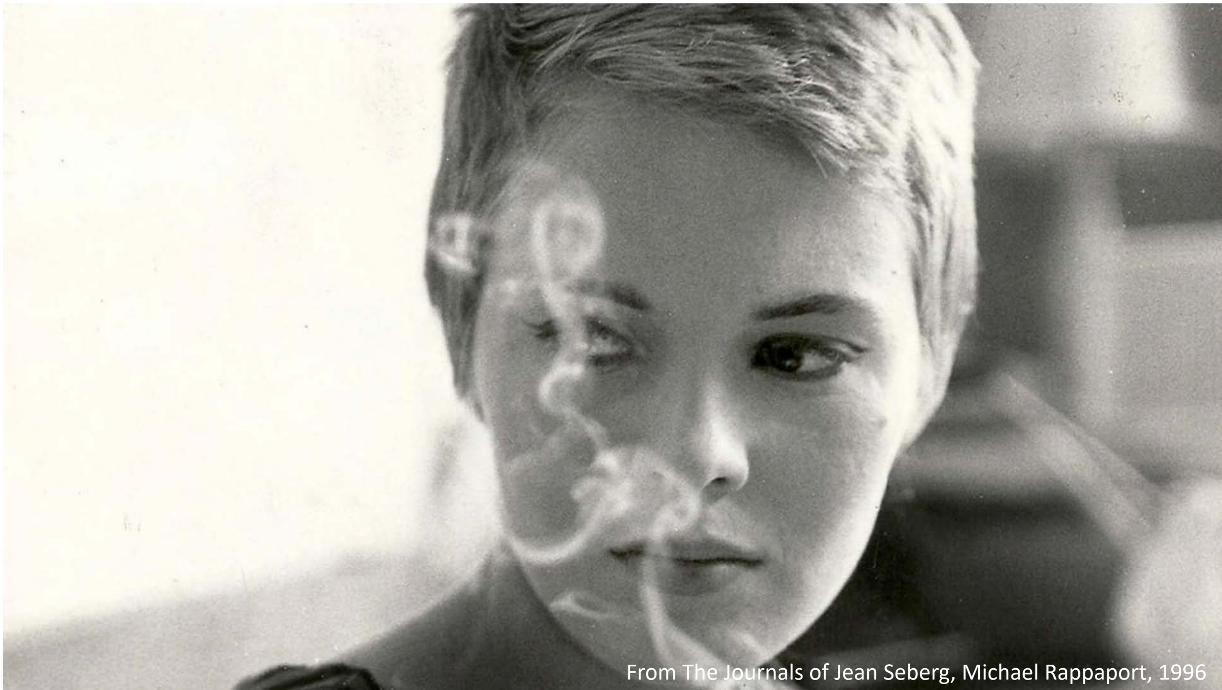
From The Journals of Jean Seberg, Michael Rappaport, 1996