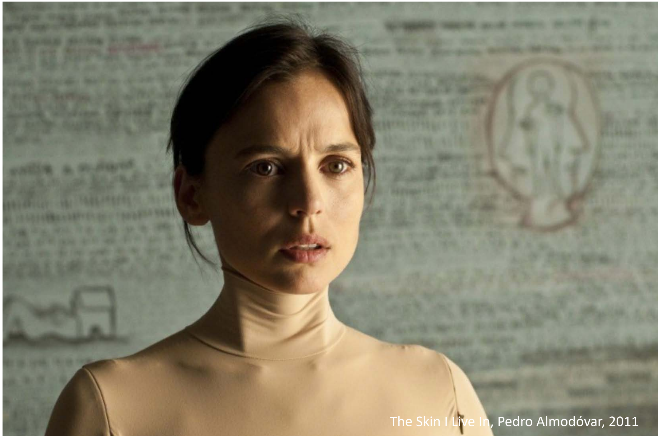
The Skin I Live In, Pedro Almodóvar, 2011