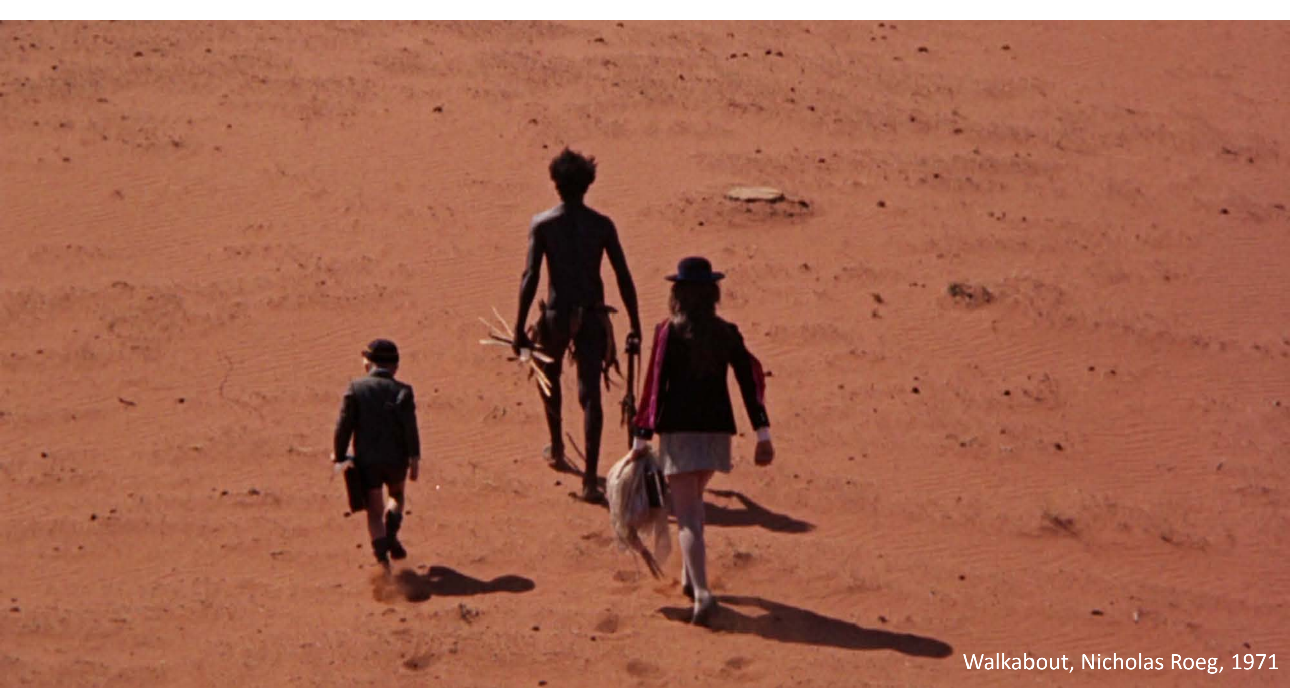
Walkabout, Nicholas Roeg, 1971