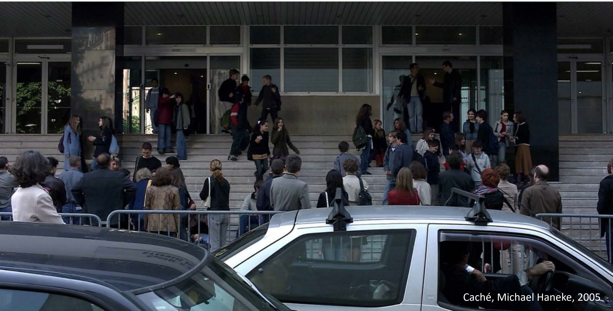
Caché, Michael Haneke, 2005