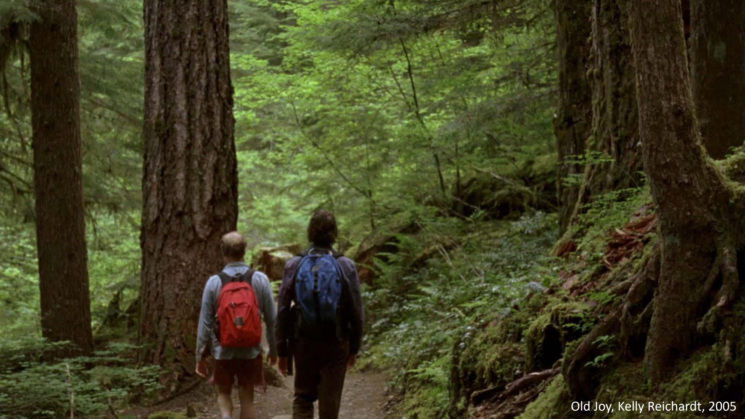
Old Joy, Kelly Reichardt, 2005