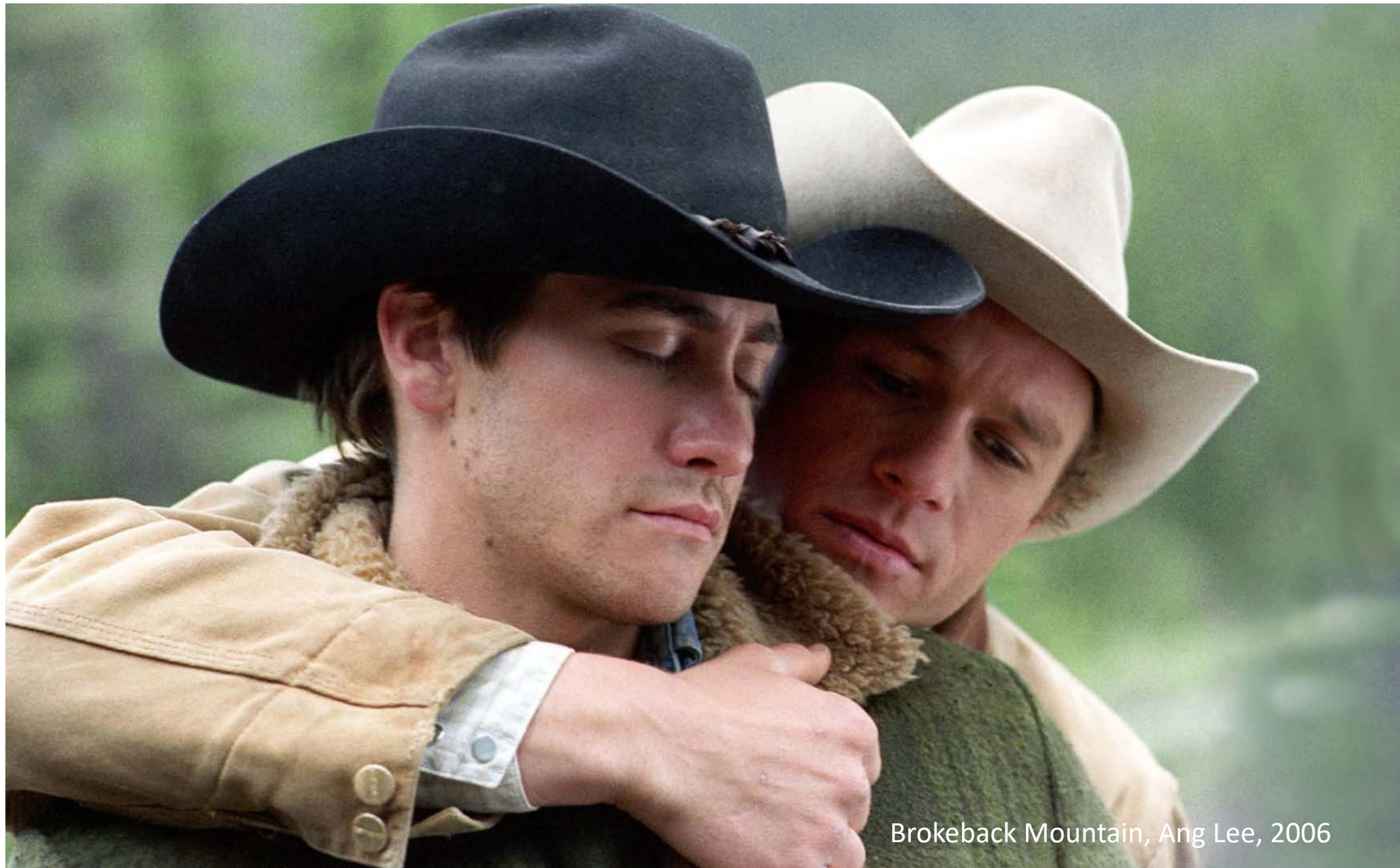
Brokeback Mountain, Ang Lee, 2006