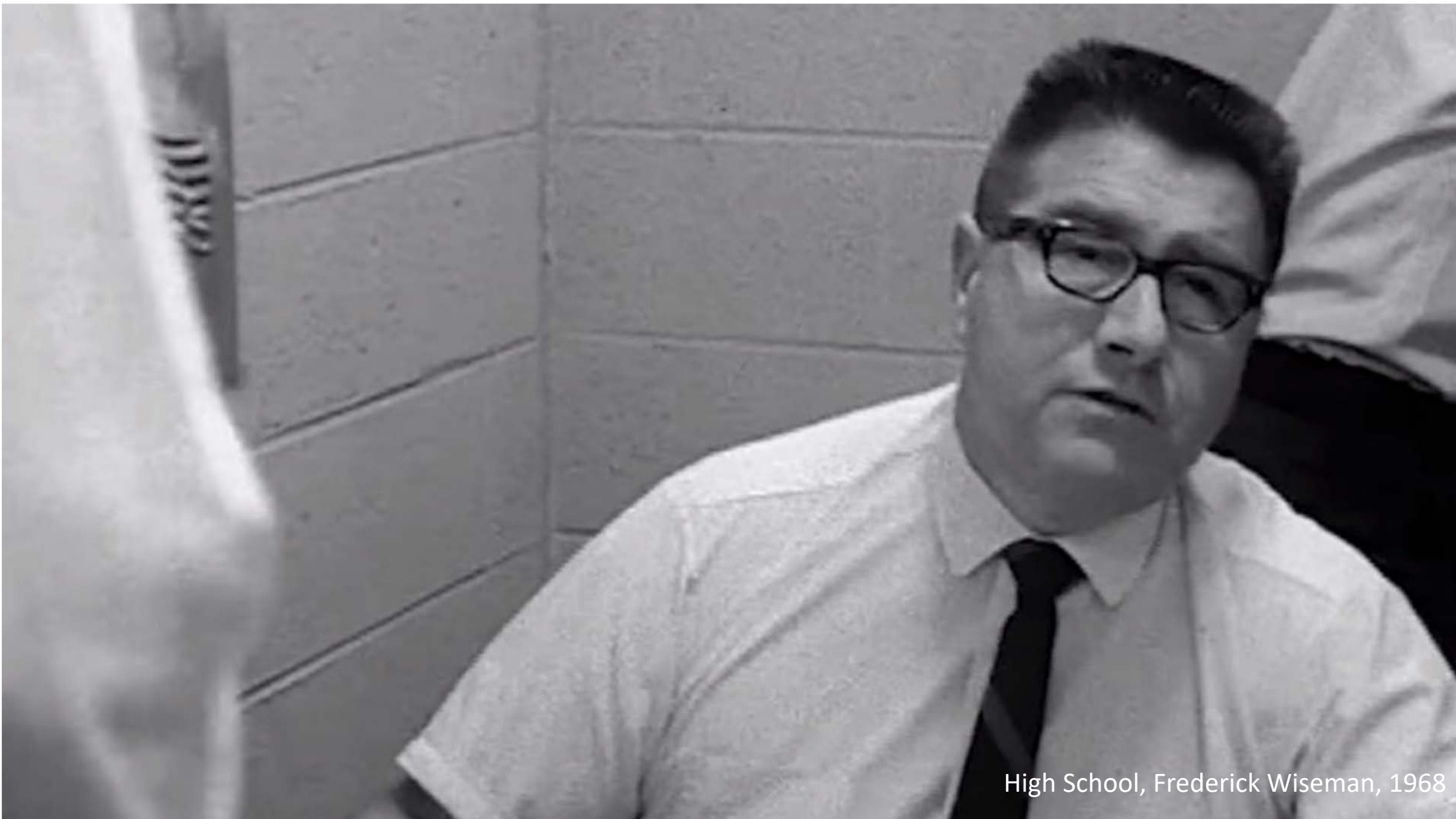
High School, Frederick Wiseman, 1968