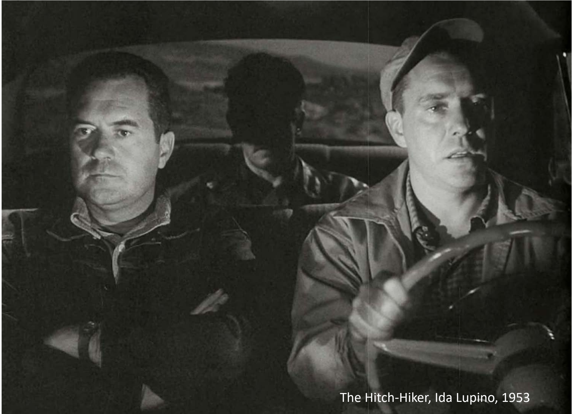
The Hitch-Hiker, Ida Lupino, 1953